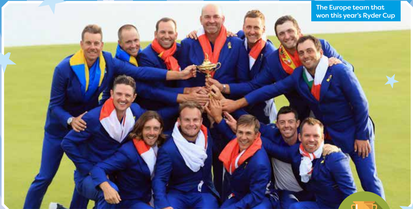
The Europe team that won this year's Ryder Cup

Which individual or team was the most heroic in 2018? Have we left anybody out? You decide!