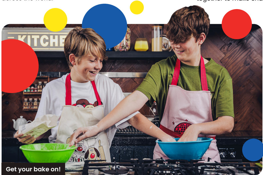
Get your bake on!

Find out more at comicroelief.com/rednoseday