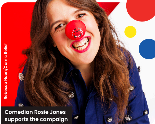
Comedian Rosie Jones supports the campaign

The day was set up back in 1988 to help raise money for a charity called Comic Relief. It encourages people to wear a red nose, do something silly and make a difference. Every year, tens of thousands of people and schools all over the country join in the fun, raising millions of pounds and helping to change millions of lives in the UK and across the world.