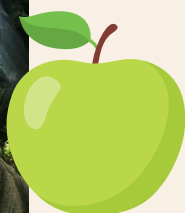
Archie and the new variety of apple