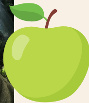
Archie and the new variety of apple