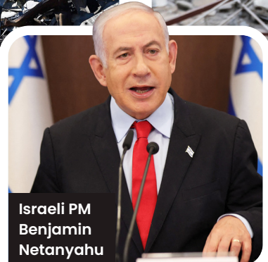
Israeli PM Benjamin Netanyahu

died, and more than ten British citizens are feared to have died or are missing.