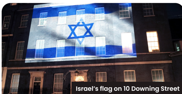
Israel’s flag on 10 Downing Street