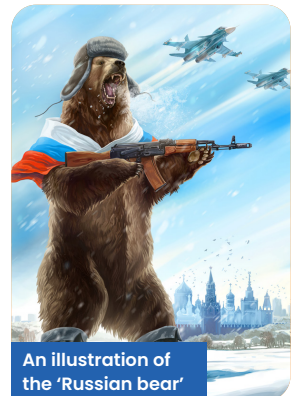
An illustration of the 'Russian bear'

Russia as a country has often been nicknamed the 'Russian bear', but Ukraine also has a bear on its side – Paddington! Ukraine's president, Volodymyr Zelensky, used to be an actor and comedian – and provided the voice for Paddington in the Ukrainian versions of the two hit movies.