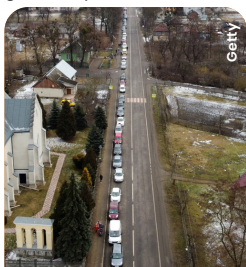
Cars queue as people try to cross the border into Poland

It's impossible to say. Russia has been funding small rebellions in eastern parts of Ukraine for years, but a full-scale assault is another matter. The attacks are seriously harming Russia's global reputation, and the world's countries