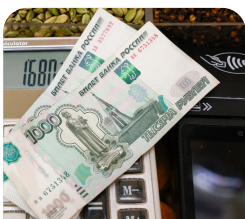
Sanctions on Russia are making it money, which, worth less, route puts pressure on Russia's economy

If you are worried, speak to an adult you trust or contact Childline on 0800 11 11.