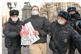
A man is led away by police officers in Moscow, Russia, for protesting against the war

Although Russia's military is much bigger and has better equipment, Ukrainian troops are fiercely defending their country. They are also being helped by many civilians who have bought weapons and taken shooting lessons in recent months. Some Ukrainian businesses have even stopped producing goods so that they can make weapons instead.