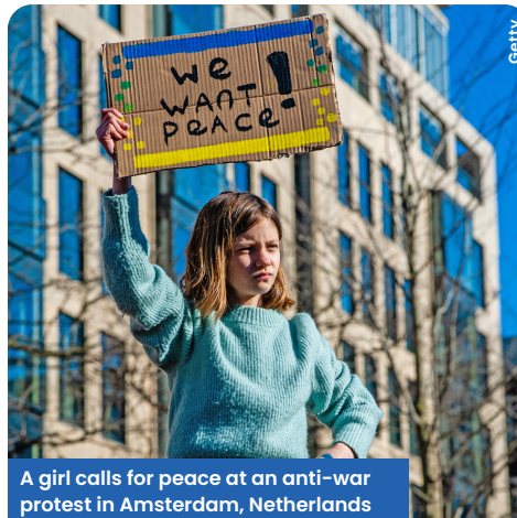
A girl calls for peace at an anti-war protest in Amsterdam, Netherlands

many people's minds right now. World leaders are being joined by business leaders to make it harder for Russia to make money (see p3). Sport is also helping to increase the pressure on Russia from all angles. Russian athletes are being banned from many international events, including the Champions League and the qualifiers for this year's men's football World Cup, which is the most-watched sporting event in the world. Sport, especially football, is big business and has huge influence around the world, so it all helps to pile pressure on Russia.