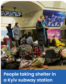
People taking shelter in a Kyiv subway station