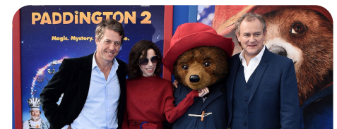
Children's charity UNICEF says Paddington's kindness makes him a perfect champion for them

Ukrainians and their many supporters have been protesting in cities all around the world, with many people criticising