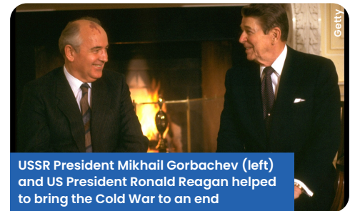
USSR President Mikhail Gorbachev (left) and US President Ronald Reagan helped to bring the Cold War to an end

The decision to allow former Soviet states to join NATO also upset Russia because, back in 1990 and 1991, many Western leaders told the Russians they would not look to grow NATO eastward.