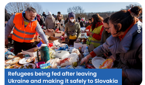
Refugees being fed after leaving Ukraine and making it safely to Slovakia

By Monday, more than half a million people had already fled Ukraine. Most have crossed into Poland, Hungary, Romania and Moldova. Organisations like UNICEF and the Red Cross have set up camps where people can shelter, warm up and get food. Countries around the world are taking Ukrainian people in, and many people who aren't from Ukraine, such as students who are studying there, are being helped to get back to their own countries.