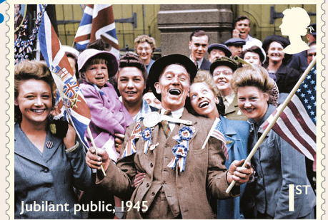
Jubilant public, 1945

Many people decorated their homes in red, white and blue, and held ‘stay-at-home street parties’. Neighbours hung bunting over their homes, had picnics in their back or front gardens, while remembering social distancing and keeping at least 2m apart from others.