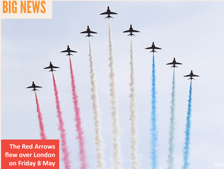
The Red Arrows flew over London on Friday 8 May